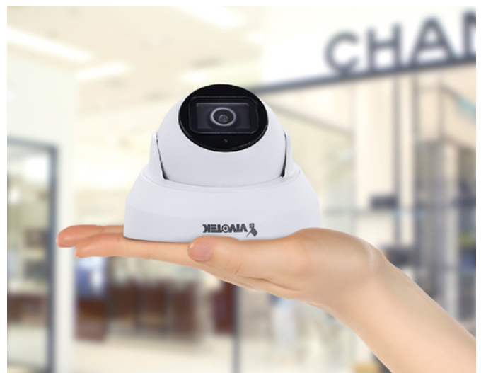
Easy Installation and Compact Size