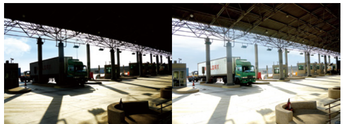
Without WDR Pro